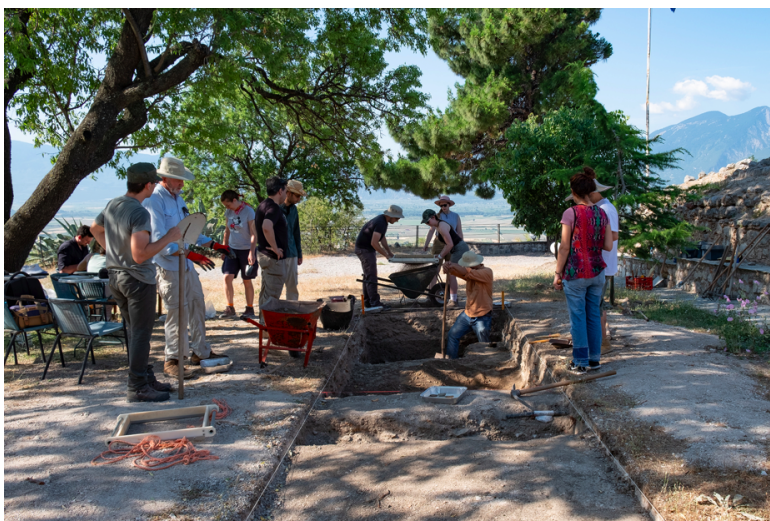
Excavations at Akrolamia (2019)