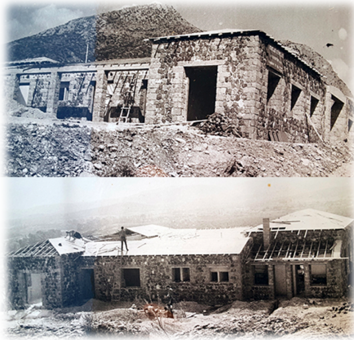
The Melathron under construction (1967-1969)