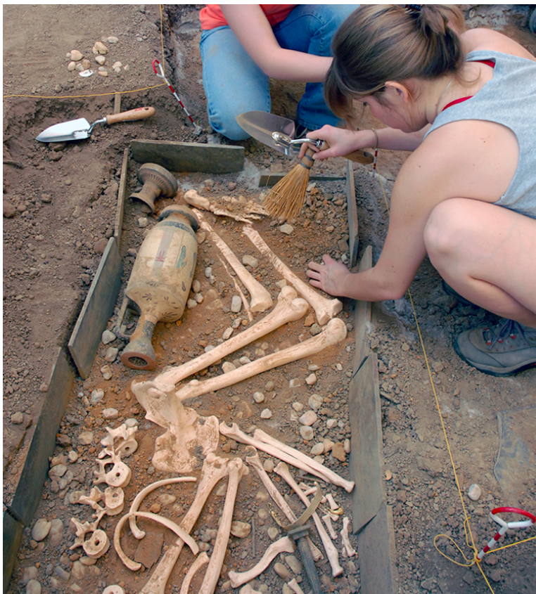
Students working in the dig simulator

MYCENAEAN FOUNDATION, INC. (est. 1967): DEDICATED TO DISCOVERING, PRESERVING AND TEACHING