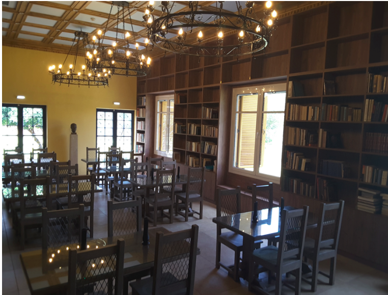
The M.H. Wiener Library (above) and the Peristyle Court of the Melathron (below)