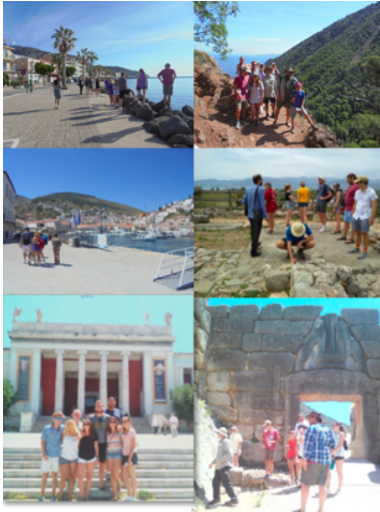
Students and faculty on field trips in Greece (2019)