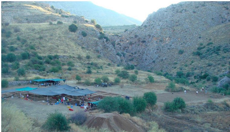
Excavations of the Lower Town at Mycenae (2007-2013)