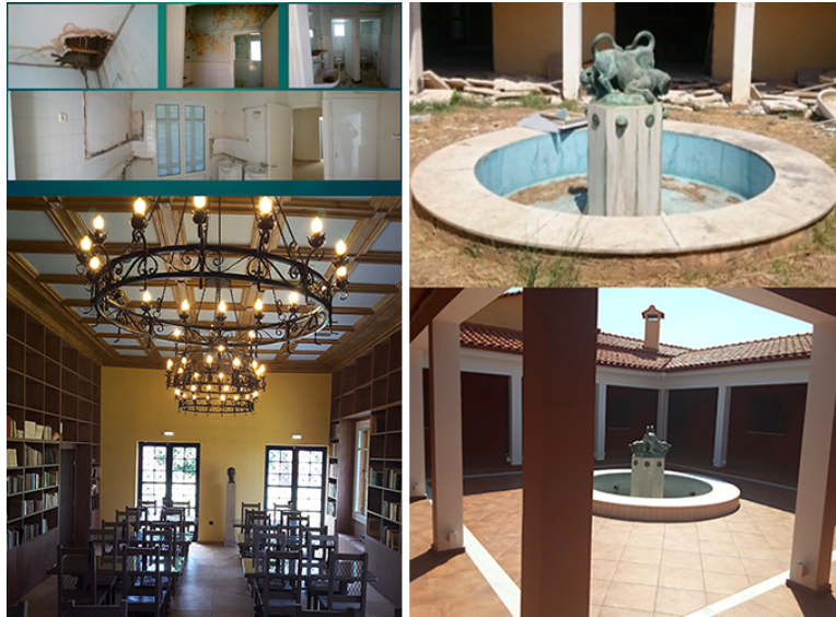
Before-and-after photographs of the Melathron

The Melathron has been restored to its former glory to host the American Center for Archaeology at Mycenae (A.C.A.M.) and serve students, scholars, and the general public.