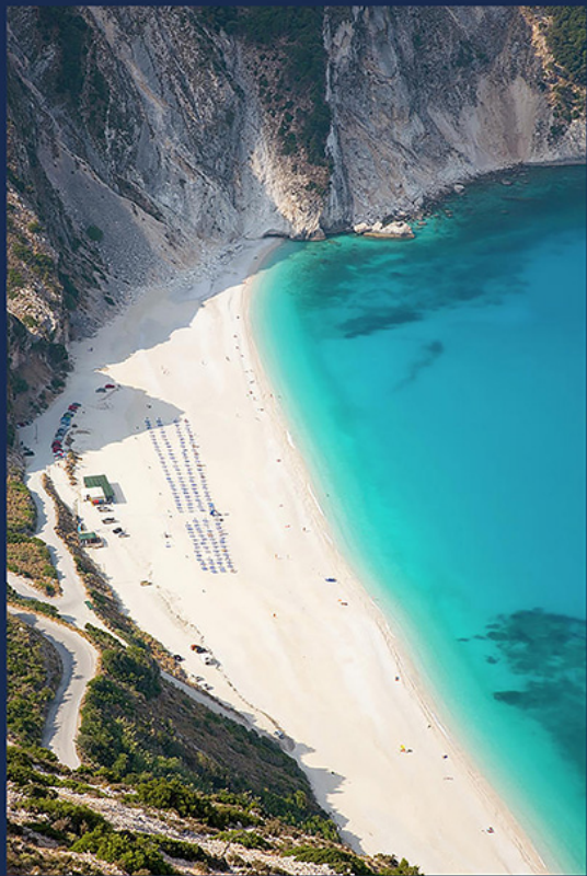
Kefalonia: Myrtilos Beach