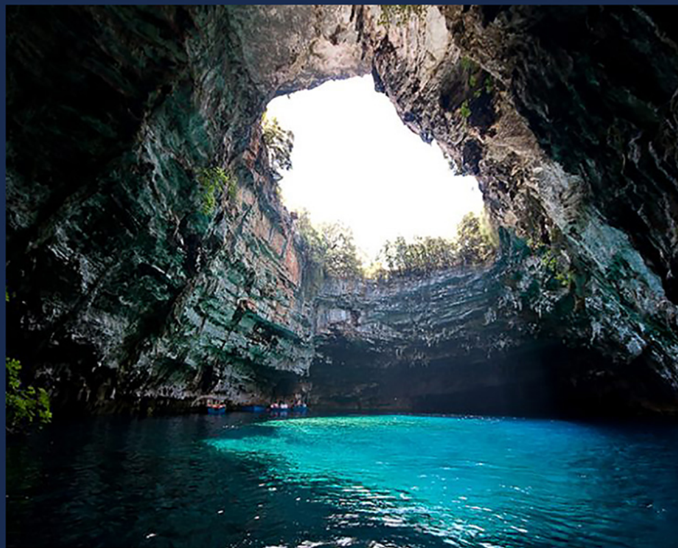
Kefalonia: Melissani Cave